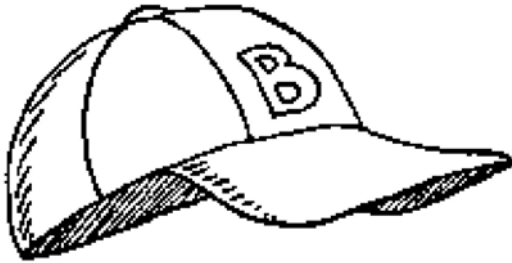
THE BOSTON RED SOX WIN A WORLD SERIES